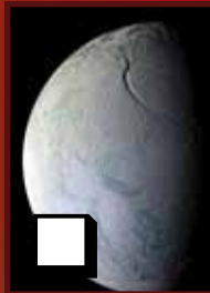
Saturn's moon Enceladus